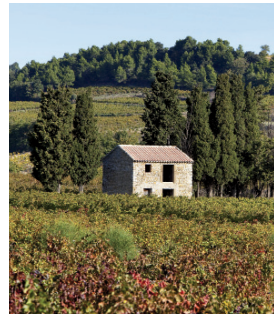
Shepherd's hut, nestled among the vines